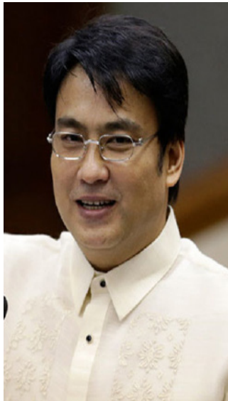
Sen. Bong Revilla