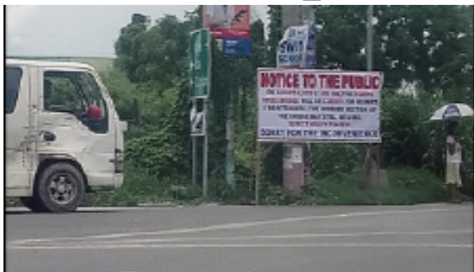
Closure of the Tejero bridge due to a 5 month repair

GENERAL TRIAS CITY, Cavite – The Department of Public Works and Highways (DPWH) has announced the closure of the Tejero bridge here for its five-month repair and maintenance beginning Aug. 4 this year.