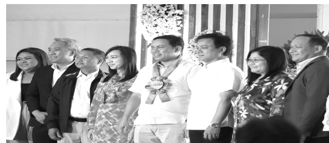
Senator Mark Villar with local leaders from the province of Laguna.

During the Laguna Business Stakeholders Convention and Innovation Summit held at the Cultural Center of Laguna, Sta. Cruz on March 15, Senators Imee Marcos and Mark Villar and local leaders headed by