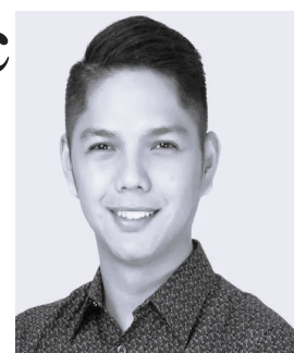
Mayor Kevin Anarna

Meeting the basic healthcare needs of Silangeños. Cavite provincial government's commitment in nurturing the well-being of the Caviteños was once again witnessed in a medical mission bringing basic healthcare services to the Municipality of Silang, Cavite on March 18, 2024.