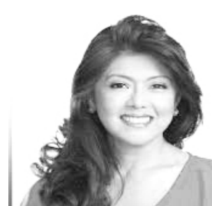
Senators Imee Marcos

In the 2022 Provincial Product Accounts (PPA) data released by the Philippine Statistics Authority (PSA) on Feb. 19, Laguna accounted for the largest share among the 82 provinces in the country with P990 billion value in the 2022