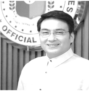
SEN. Bong Revilla, Jr.