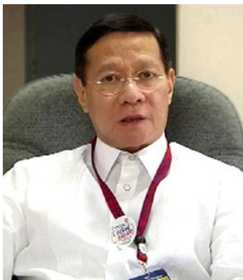
Health Secretary Francisco T. Duque III

While vaccines given during infancy provide children