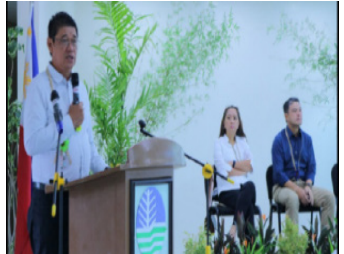
NEW DENR CALABARZON HEAD. New Environment and Natural Resources regional director for Calabarzon Gilbert C. Gonzales delivers his speech during a simple turn-over ceremony at Calabarzon regional office in Calamba, Laguna on July 5, 2019. Gonzales urged DENR Calabarzon officials and staff to focus on actual environmental issues.