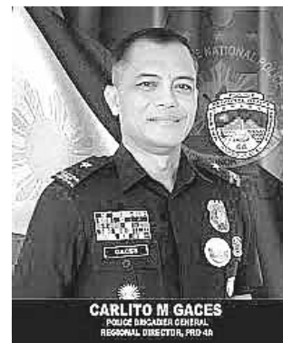
nahan ni dating PNP Chief Rodolfo S. Azurin, Jr. bago