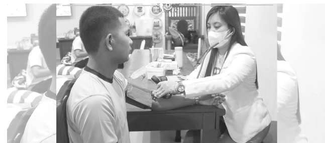
BLOODLETTING ACTIVITY: “KAPULISA’Y KABALIKAT, DUGO PARA SA LAHAT”