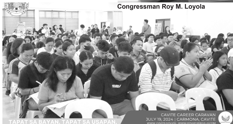
TAPAT SA BAYAN. TAPAT SA USAPAN.