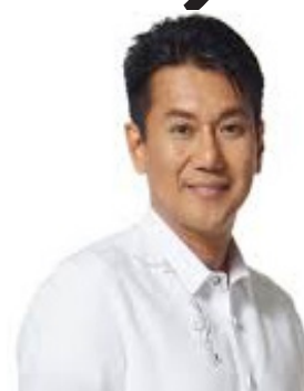
IMUS MAYOR EMMANUEL L. MALIKSI

IMUS CITY, Cavite (PIA) -- Imus City Mayor Emmanuel L. Maliksi conveyed the Cluster Scheduling, a more stringent measure for the implementation of the Extended Extreme Enhanced Community Quarantine (EE-ECQ) in the city.