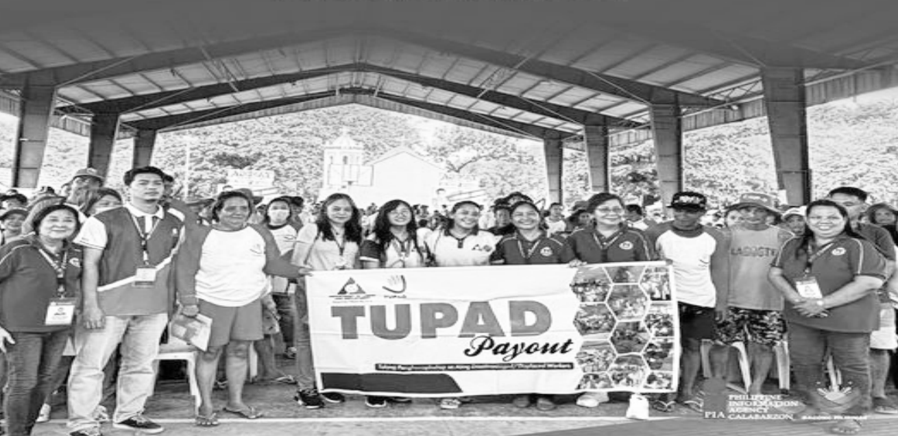
Close to 841 individuals benefitted from the Department of Labor and Employment’s Tulong Panghanap-buhay sa Ating Disadvantaged/Displaced Workers (TUPAD) program.