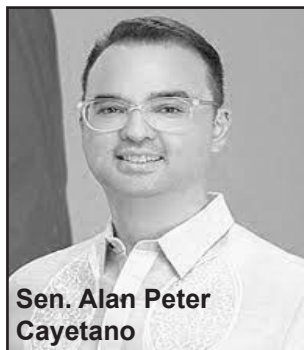
Sen. Alan Peter Cayetano

Sa unang araw ng debate sa plenaryo tungkol sa 2025 national budget kasama ang Development Budget Coordination Committee (DBCC) nitong November 6, 2024, muling ipinaalala