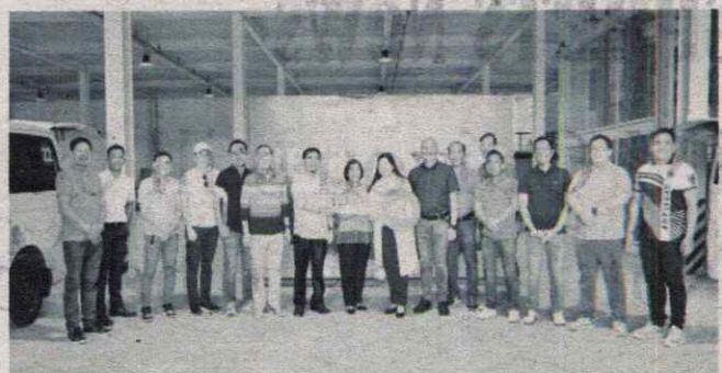
Blessing and Turnover of 5 Ambulances at the City of Dasmariñas Warehouse on Jan. 5, 2024