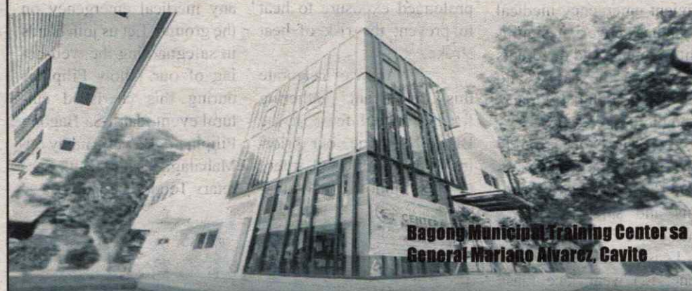
Bagong Municipal Training Center sa General Mariano Alvarez, Cavite