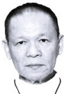
Manila Cardinal Jose Advincula