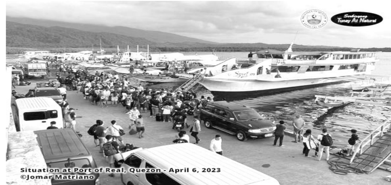
Situation at Port of Real, Quezon - April 6, 2023

Tunay ngang kahanga-hanga ang inyong tanggap-pan. Congratulations, Imus Public Library!