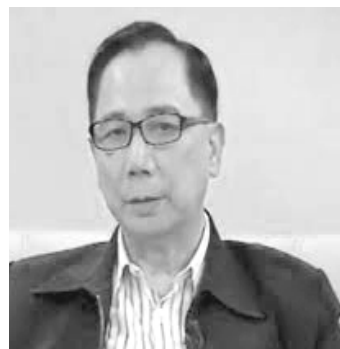
Agriculture Sec. William Dar

Highlighting the importance of food security in ensuring food sovereignty, Agriculture Secretary William Dar calls on universities and other academic institutions to urge legislators to provide much-needed substantial budgetary support to the Department of Agriculture (DA) to enable it to unlock the full potential of Philippine agriculture.