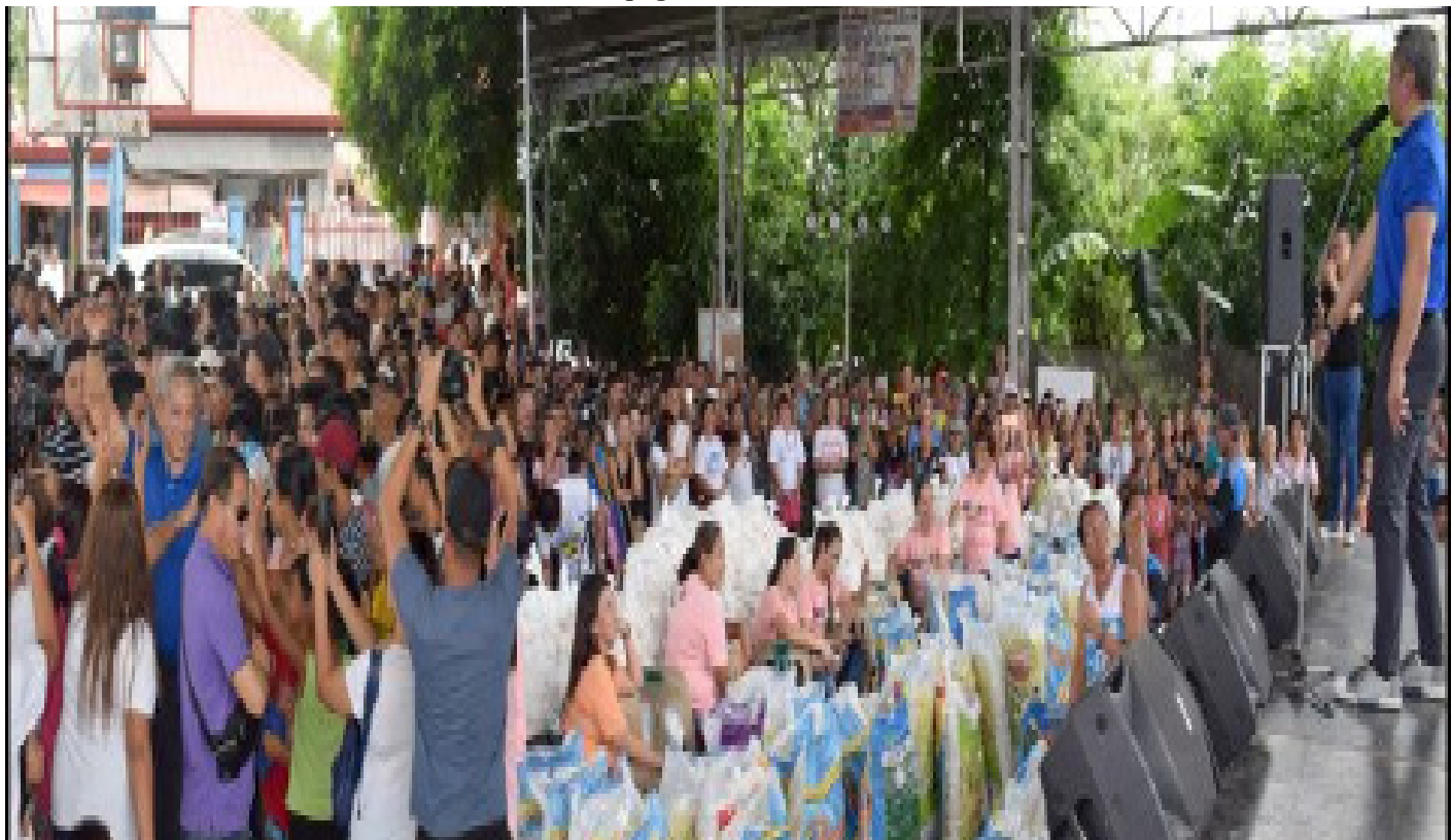
Cavite Governor Jonvic Remulla, together with Vice Governor Jolo Revilla, visited constituents