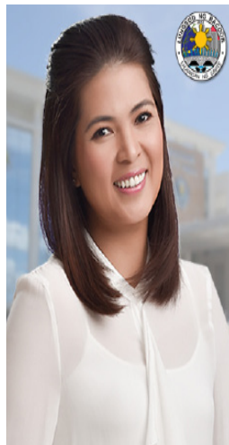
Mayor Lani Mercado-Revilla