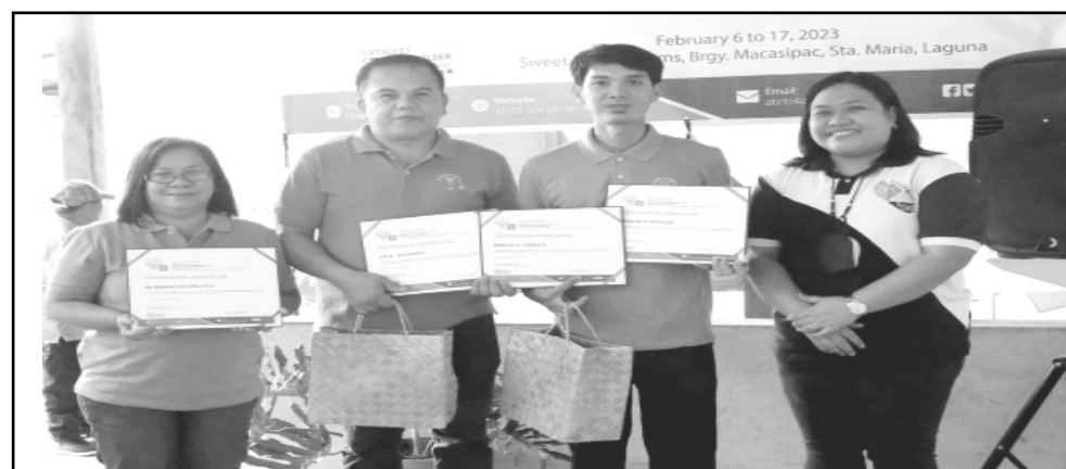
22 participants from the province of Cavite, Batangas and Rizal received certification from DA Calabarzon.