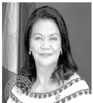
Mayor Dahlia Loyola

Isinusulong ng Seal of Child-Friendly Gov-