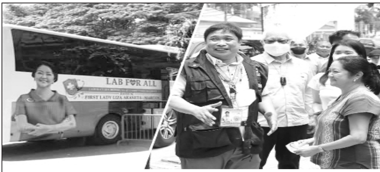
Pinangunahan ni First Lady Louise "Liza" Araneta-Marcos ang paglulunsad ng LAB for ALL Caravan na naghatid ng iba't ibang serbisyong medikal sa Batangas City.