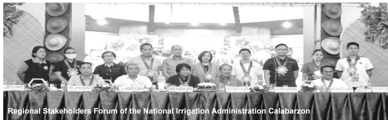
Regional Stakeholders Forum of the National Irrigation Administration Calabarzon