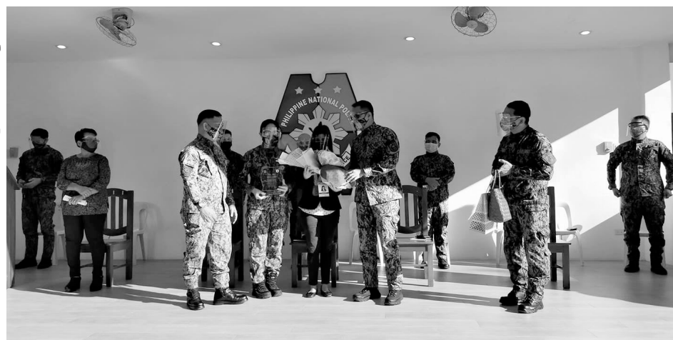
Cavite Police Provincial Office (PPO) joins the 2021 National Women's Month Celebration in their Kick-off Ceremony held at Camp BGen Pantaleon Garcia, Imus City on March 1, 2021