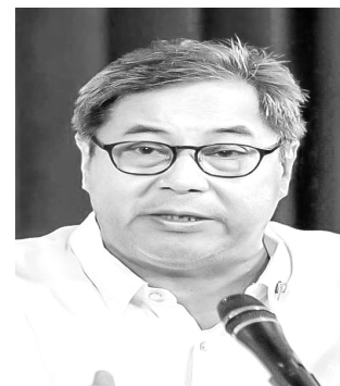
DOH Secretary Teodoro Herbosa