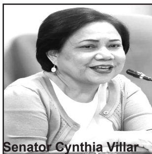
Senator Cynthia Villar

In her acceptance speech during the awarding ceremony at the Manila Hotel on Tuesday, Villar thanked the UNAP Board of Trustees for recognizing her commitment to eliminating