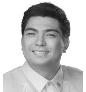
Rep. Jolo Revilla

Ang bagong tatlong palapag na health center na sinimulang itayo noong 2022, ay isang pangunahing proyekto ng