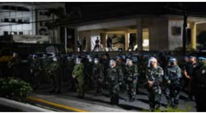
UNA AT PANGALAWA NA LARAWAN:Sa tulong ng mga Barangay Officials at volunteers, nahatiran na po ng tulong mula sa City Government ang mga kababayan natin sa Barangay Bacao I, Bacao II at Lavanya Subdivision, gayundin sa ilang bahagi ng Barangay Tejero at Dream Homes. Puspusan parin ang ginagawang repacking ng relief goods para sa agarang distribution sa iba pang lugar.