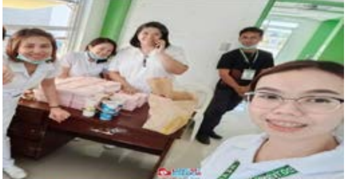
Nagpadala ng pagkain si Mayor Lani Mercado Revilla sa mga frontliner health workers sa Southern Tagalog Regional Hospital. Mga ngiting pasasalamat naman ang ipinaabot ng mga health workers kay Mayor Lani na kasalakuyang sumasailalim sa self-quarantine.