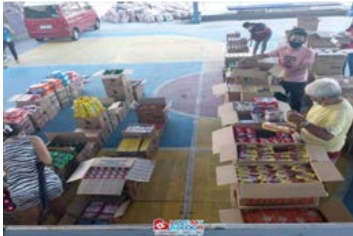
Patapos na ang unang araw ng ating Mobile Store sa Brgy. Daang Bukid. Maraming salamat sa Department of Trade and Industry (DTI) at Puregold. Salamat din sa mga namili at sumunod sa patakaran nating social distancing. Umantabay lamang sa mga susunod na schedule sa inyong mga barangay.