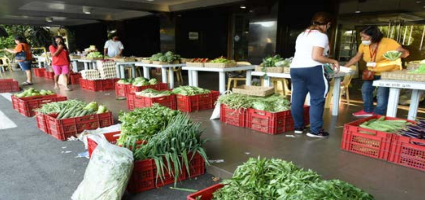
Fresh fruits and vegetables are among the agricultural products being sold at the KADIWA mobile market.

The Kadiwa stall in DA-ATI opens weekly every Thursday to Saturday from 6 am to 5 pm, while the stall in Cainta serves every Friday to Sunday, also from 6 am to 5 pm. (DA/PIA-NCR)