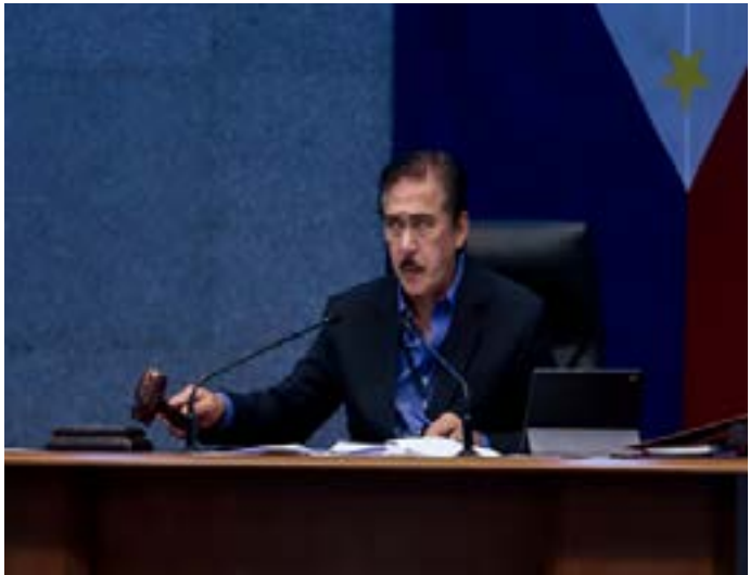
Approved: Senate President Vicente Sotto III bangs the gavel past midnight, March 24, 2020, signifying the approval of Senate Bill No. 1418 or the Bayanihan to Heal as One Act declaring a national emergency and granting President Rodrigo Duterte powers to fight the COVID-19.