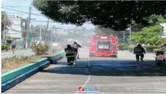
Ang kawani ng Bacoor City Fire Station ay walang pinipiling oras, araw man o gabi ay puspusan sila sa pagsasagawa ng Decontamination at Disinfection sa kalawakan ng buong Lungsod na Bacoor. Kamakailan ay natungo sila sa Barangay Panapaan V, Kaingen, Talaba 1 at 2, Panapaan 8, at Molino 2.