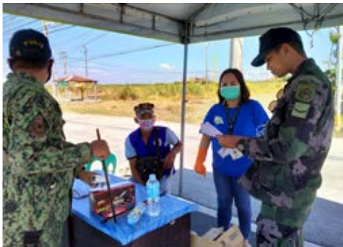
Staff of the Department of Agriculture Region IV-A CALABARZON Agricultural Program Coordinating Office (APCO) in Cavite visit checkpoints around Cavite province to provide and explain to military personnel manning the checkpoints the DA & DILG Memo Circulars and Advisory on the continuous movement of agricultural and fishing products.

"That is why we will continue making rounds to ensure said issuances are properly disseminated down to the checkpoints, especially in the barangay level,"