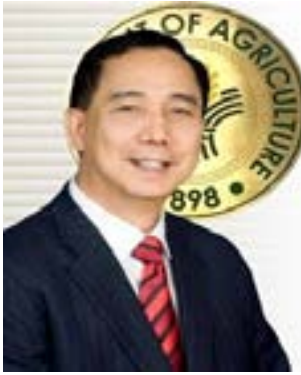
Agriculture Secretary William D. Dar

The Kadiwa outlets sell fresh vegetables and oth-