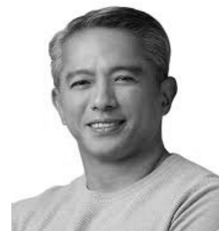
DILG Secretary JONVIC REMULLA

Based on the latest PAGASA Storm Surge Warning issued at 2 a.m. Saturday, there is a high risk of life-threatening storm surge with peak heights exceeding 3.0 m within the next 48 hours over several areas in Ilocos Norte, Ilocos Sur, La Union, Pangasinan,