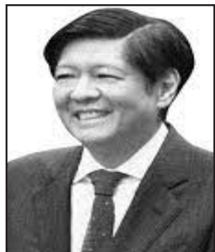
Pres. Ferdinand "Bongbong" R. Marcos, Jr.

MANILA — Noting that an informed citizenry is the foundation of a truly working democracy, President Ferdinand R. Marcos Jr. highlighted on Thursday, Nov. 14, the important role played by the media in combating disinformation and misinformation in the country.