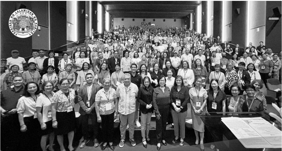
11th Cavite Cooperative Leaders' Conference on November 7, 2024 at SM City Rosario, Cavite.