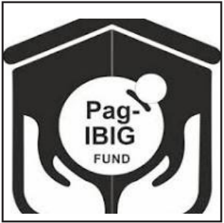
Pilipinas governance agenda of President Ferdinand R. Marcos Jr.’s administration.

employee’s contributions, members to conveniently repeat their regular and MP2 savings and borrowers to pay for their housing loans and short-term loans monthly.” The Pag-IBIG Fund aims to streamline processes and reduce wait times to deliver excellent service to its over 16 million members nationwide. The Virtual Pag-IBIG can be downloaded through the official website and major app stores. (AM/PIA 4A) Kapihan sa Bagong Pilipinas is a weekly media forum program of the Philippine Information Agency, in partnership with the Presidential Communications Office, highlighting the programs, projects, and policies of the national government under the Bagong