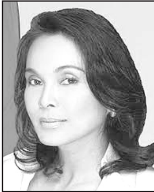
Sen. Loren Legarda

“Sa pamamagitan ng paggunita sa petsang ito, binibigyang-pugay natin ang mga sakripisyong ginawa ng mga nakipaglaban para sa