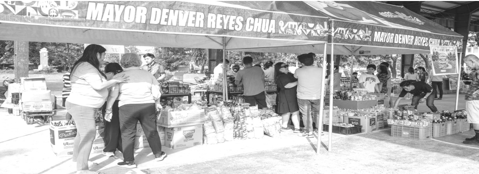
Nagkaroon kamakailan ng pagkakataon ang mga Caviteño makapamili ng mga pangunahing bilihin sa abot-kayang halaga sa tulong ng Kadiwa ng Pangulo, isang proyekto ni Pangulong Bongbong Marcos katuwang ang local government of Cavite City sa pangunguna ng ating top performing Mayor Denver Reyes Chua.