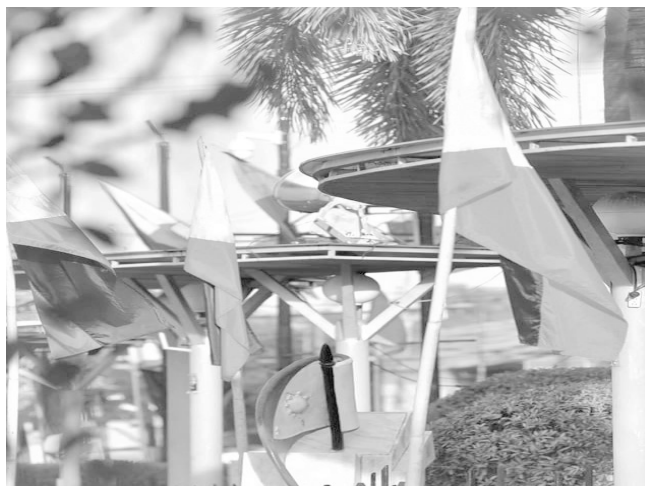
The City of Imus is all set for the 123th Independence Day celebration in preparation for the country's 123rd Independence Day celebration on Monday, June 12, 2021.