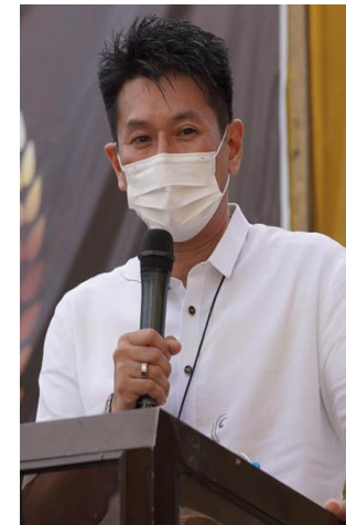
Imus City Mayor Emmanuel Maliksi