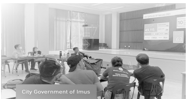
Along with the Pride Month celebration this June, this Friday held the Multi-Sector (STI, HIV, AIDS) Council Meeting. The issues of reproductive health were discussed at the meeting along with effective programs implemented around it. These programs include Test Landing on You, a house-to-house testing service led by Imus Reproductive Health and Wellness Center.