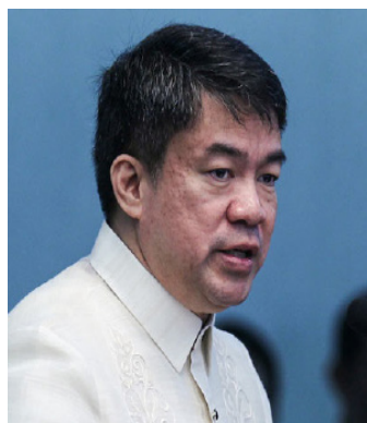
Senator Aquilino "Koko" Pimentel III

Senator Aquilino "Koko" Pimentel III today reiterated the urgency of passing an "Anti-Endo" law, saying that a measure banning the hiring of workers for fixed-term arrangements or end of contract (endo) schemes should be considered "highest priority" before the May 2019 elections.