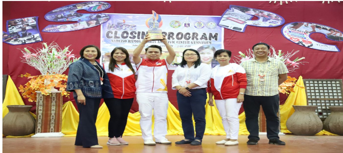
For the seventh consecutive year, CALABARZON was declared recently the overall champion of the National Schools Press Conference (NSPC) held in Lingayen, Pangasinan from January 28 to February 1.