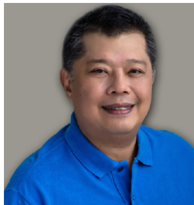
Cavite Governor Boying Remulla