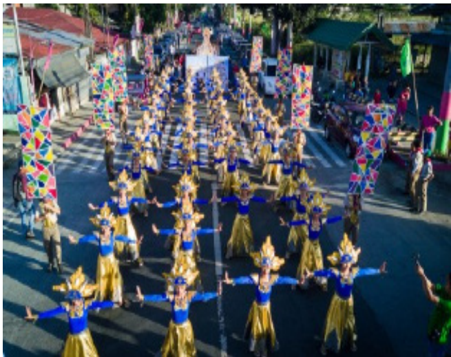
SUMILANG FESTIVAL is an annual thanksgiving celebration for a bountiful harvest of Silang town.

led the fundraising campaign from the faithful, and the proceeds were used to purchase the sterling silver fineries and regalia in honor of the Blessed Mother's devotion to the community of Silang," he added.