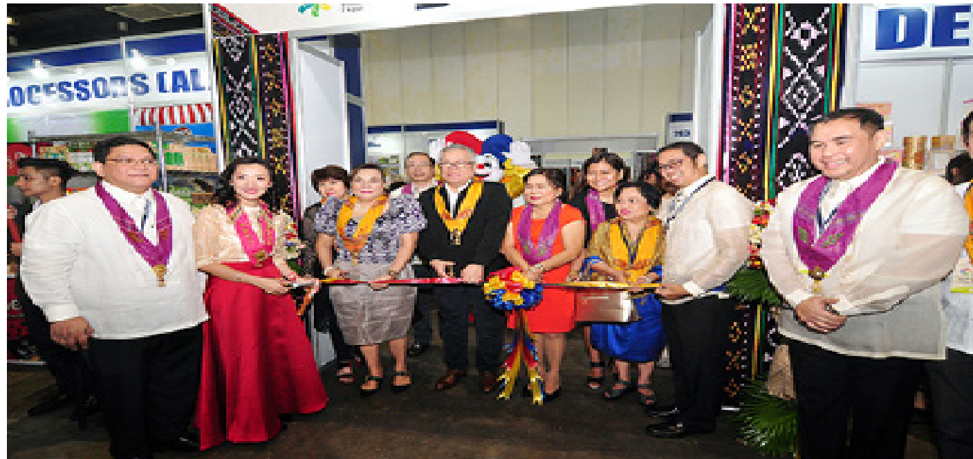
17th Filipino Franchise and Business Expo: Senator Cynthia A. Villar, leads the ribbon-cutting ceremony during the opening of the 17th Filipino Franchise and Business Expo at the World Trade in Pasay City. The re-electionist senator acknowledges the significant contribution of the organization in poverty reduction and the country's economic growth.

SILANG, Cavite -- The 9th Sumilang Festival, which is celebrated in this historic town from January 20 to February 8, comes with pomp and pageantry but with more meaningful celebration for the town’s 424th founding anniversary and homage to its patron saint “Our Lady of Candelaria”.