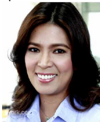
Bacoor City Mayor Lani Mercado Revilla

BACOR CITY, Cavite (PIA) – Thousands of volunteers from the city government of Bacoor and the provincial government along with various groups from government agencies and socio-civic organizations gathered at the Barangay Zapote V Multi-purpose plaza here early morning Sunday to join the massive launching of the Manila Bay Rehabilitation Program dubbed as the #BattleForManilaBay.