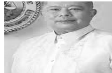
(DHSUD) Secretary Jose Rizalino Acuzar

MANILA – A total of 105,212 Home Development Mutual Fund or Pag-IBIG Fund members were able to avail of its home loan program for the year 2022.