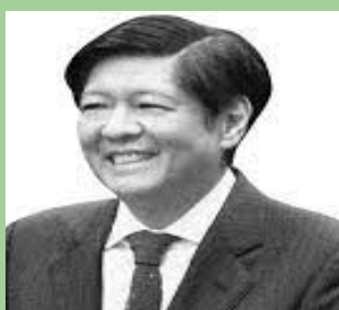
Pres. Ferdinand “Bongbong” R. Marcos, Jr.

SILANG, Cavite - Nasa bilang na 223 cadets ang nagtapos sa Philippine National Police Academy (PNPA) Layag-Diwa Class 2024 noong Byernes sa PNPA Headquarters, Camp General Mariano N. Castaneda sa bayang ito. Pina-ngunahan ng Pangulong Ferdinand “Bongbong”