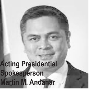
Secretary and Acting Presi- dential Spokesperson Martin M. Andanar during his press briefing.

“Kinikilala po nat- in ang nakapahalagang pap- el ng ating mga kababai- han hindi lamang sa ating tahanan, kundi pati na rin ang kanilang kontribution sa ating lipunan,” said Pres- idential Communications