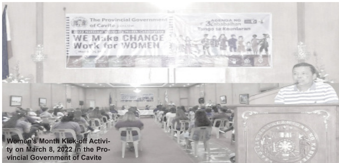
Women's Month Kick-off Activity on March 8, 2022 in the Provincial Government of Cavite