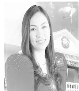
Mayor Jenny Austria-Barzaga

TRECE MARTIRES, Cavite (PIA) – Two moreschools in the city of Dasmariñas welcome the students back for the conduct of the expanded limited face-to-face classes after two years of distant learning due to Covid-19 pandemic on March 7, 2022.