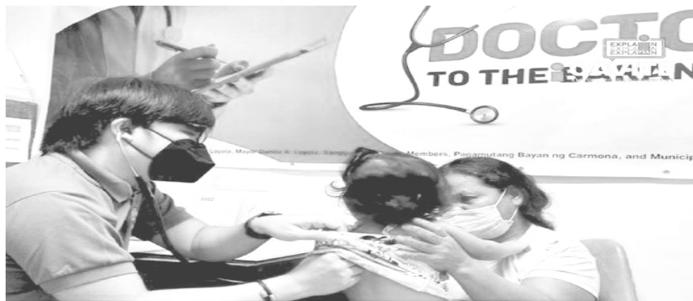
CARMONA | More residents in the town of Carmona will be reached by health services, after the local government launched the 'Doctor to the Barangay' program recently.

sigurong ligtas at malusog ang mga residente sa pamamagitan ng accessible health services. Bukas naman ang tanggapan ng bawat barangay at Carmona Municipal Health Office para sa karagdagang impormasyon ukol sa nasabing programa. SOURCE:— PB, PIA4A