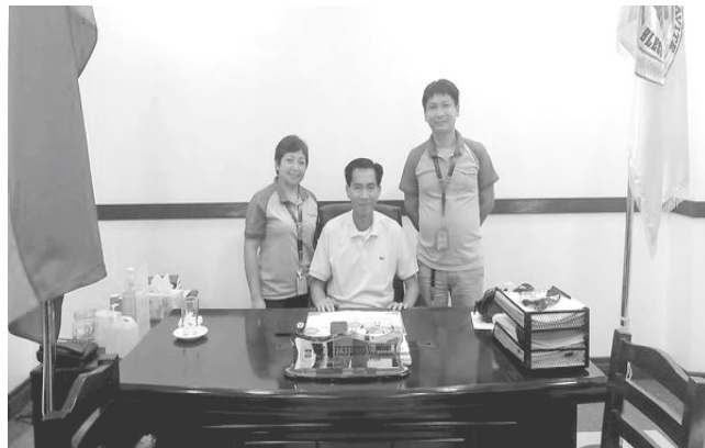
Mayor Perfecto Fidel of Indang, Cavite