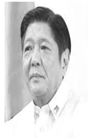
President Ferdinand “Bongbong” Marcos Jr.

“I give you a relatively free hand in deciding who you want to hire and how you want to change the structure of your department, if indeed that’s what you want to do. But do it soon because we have work to do and we have to get to work immediately,” he said.