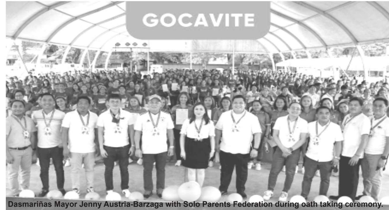
Dasmariñas Mayor Jenny Austria-Barzaga with Solo Parents Federation during oath taking ceremony.