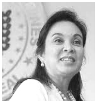
Senator Loren Legarda

MANILA, (PIA) -- Senator Loren Legarda has emphasized the importance of providing quality education for all Filipino students and helping them cope with the challenges brought about by the COVID-19 pandemic as she filed Senate Bill No. 1 or the "One Tablet, One Student Act of 2022."