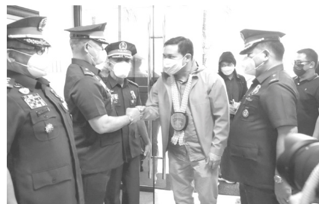
Camp BGen Vicente P Lim – Honorable Mark Aguilar Villar, Senator, Republic of the Philippines visits Police Regional Office CALABARZON last August 5, 2022.