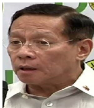
Health Secretary Francisco Duque III

The Department of Health (DOH) today signed a Memorandum of Agreement (MOA) with Rotary International's 10 Districts to heighten polio awareness and vaccination campaign in light of the reemergence of poliomyelitis in the country.