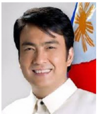
SEN. BONG REVILLA

Sen. Ramon Bong Revilla, Jr. reiterated Monday morning the importance of passing the Magna Carta for Barangay Workers during the public hearing of the Senate Committee on Local Government.