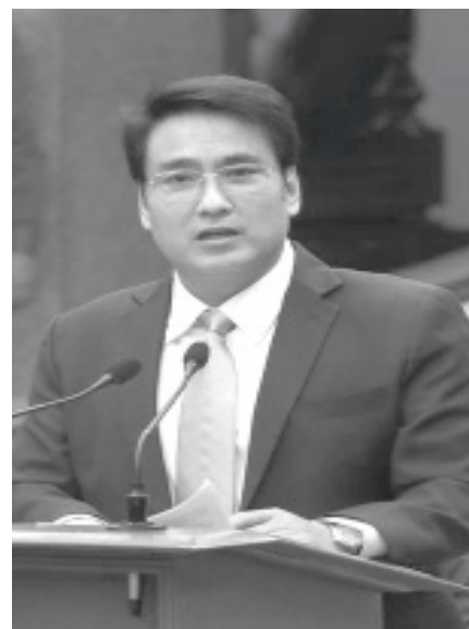
Senator Ramon Bong Revilla, Jr.

MANILA – All graduating students must plant at least 10 trees as a prerequisite to graduate and help save the environment, according to a Senate bill.