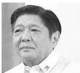
Pres. Bongbong Marcos

Marcos met with Philippine National Police