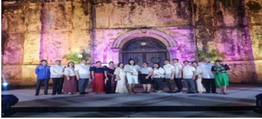
Pinarangalan kamakailan ang Lungsod ng Bacoor bilang First Runner-up sa Best Event Hosting (International) para sa City of Bacoor International Music Championships 2018 ng DOT-ATOP Pearl Awards!

and exhibits were also featured to showcase local products and delicacies of the province.