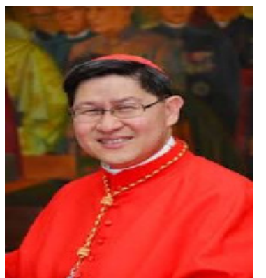
CARDINAL LUIS ANTONIO TAGLE